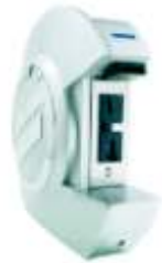
Idea Payment Box