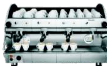
Aroma SM 300