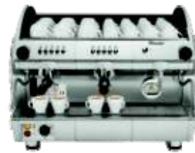
Aroma SE 200