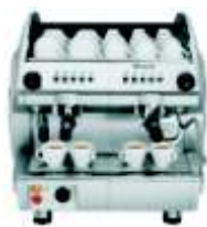
Aroma SE Compact