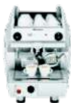
Aroma SM Compact